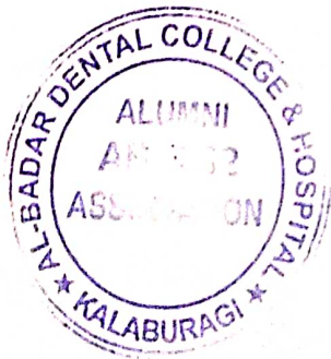
President Alumni Association

The Alumni of our institution have had a positive role in encouraging students, especially their nearer & dearer ones to consider the institution as their first choice for the professional education. Success of the Alumni is a significant factor which motivates other students to choose the same college for their education. Hence, creating a positive outlook in the whole student recruitment process for the institution. The Alumni opinion has always been beneficial for the development of the institution and proposed solutions to the hic-cups faced in the due course of the institutional functioning, which are highly valued by the institution in achieving its goal and vision.