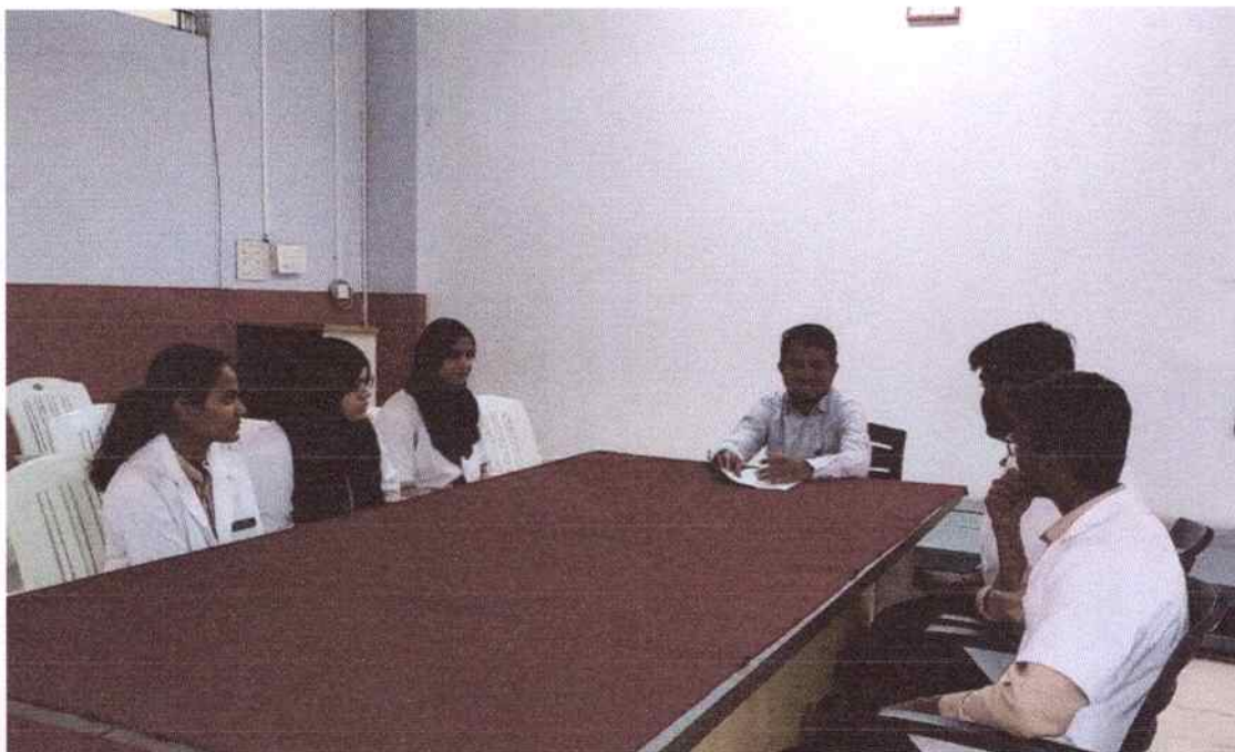
Student issues related discussion